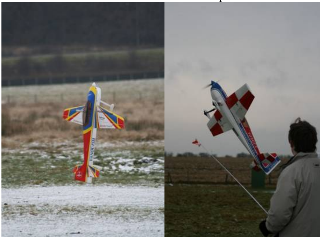
The editor with his Extreme Flight Vanquish and 58'' Extra both electric