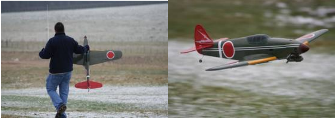
Nathan's mess about speed racer warbird