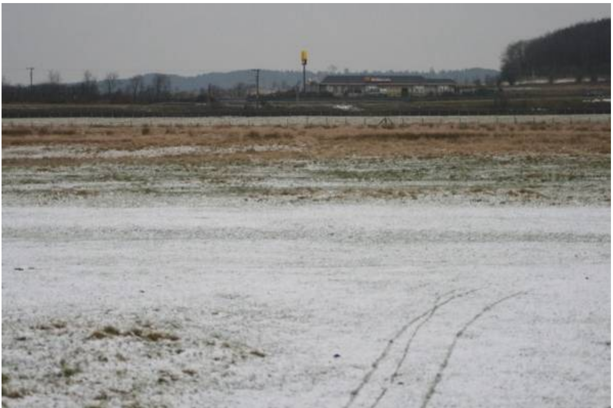
The snow covered field at Delyn!